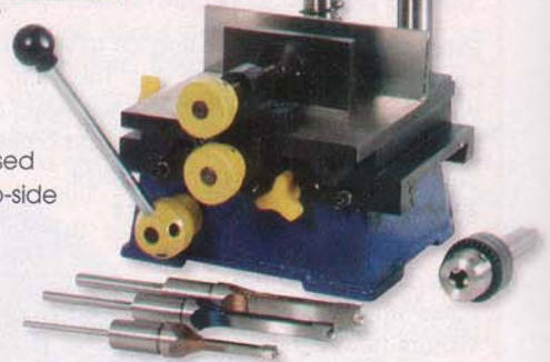
Complete machine with chisels and drilling attachment

runs really sweetly. The sliding table is a definite bonus, and the movement is precise. There were a couple of problems, though. The depth stop tended to slip on the column, so it was easy to plunge too deeply. Also the supplied chisels are only average quality and didn't always cut cleanly.