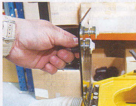
▲ Pic.2 The hood hinges back for access, held with these basic but effective lugs