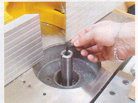
▲ Pic.3 You can remove the spindle to swap it for a router collet version