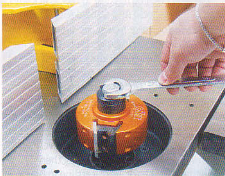
▲ Pic.1 A spindle lock means that only a spanner is required for block changes